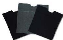
BB-5 Cloth Ballbag Colors: Navy or Gray $7.50