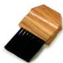
BB-1W Wooden Plate Brush $3.50