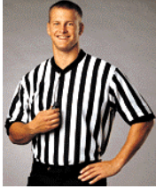
Cliff Keen Shirts

“The OFFICIAL Supplier for PIAA Sports Officials”