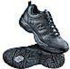
SH-NB & SH-WNB