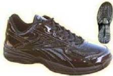
New! Reebok Patent Leather