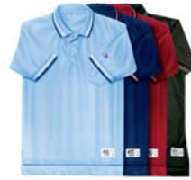
Cliff Keen Umpire Apparel