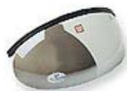
BB-SS Wilson Sunshield Tinted plastic shield that attaches to inside of all brands of face masks. $10.00