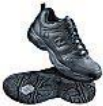
New Balance Court Shoes