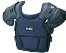
New! ProNine Umpire Equipment