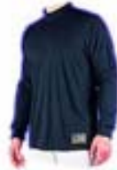
CW-918 & CW-994