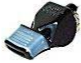
Fox 40 Whistles