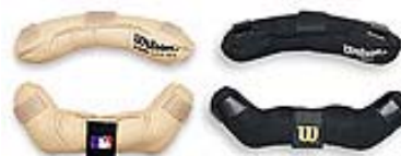
RP-1 Tan Doeskin Pads $29.00