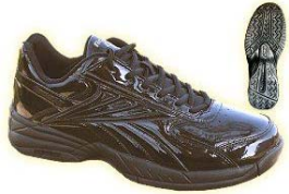
New! “Patent Leather Reeboks Shoes