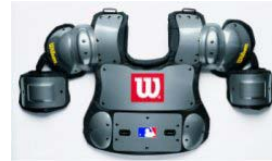
Wilson Umpire Equipment