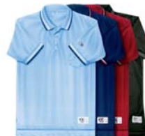
Wilson Umpire Equipment